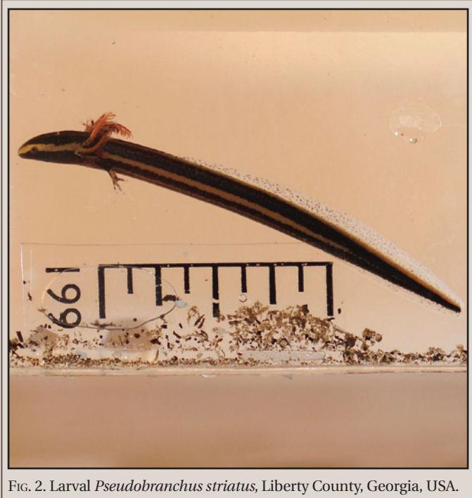
FIG. 2. Larval Pseudobranchius striatus , Liberty County, Georgia, USA.